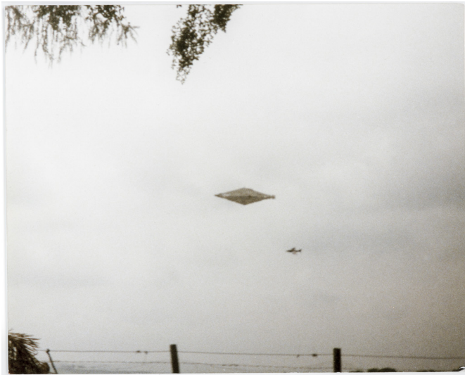
Calvine UFO photo surfaces

Cover: Meteors tend to produce UFO reports. This issue covers two cases, which were probably meteors.