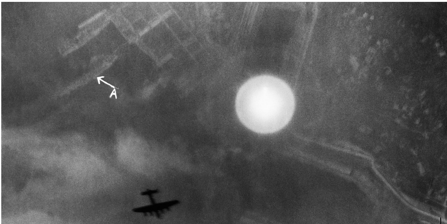
A photo flash bomb exploding over La Spezia, Italy on April 13-14, 1943

In December 1954, such photo flashes were being used at the bombing range in Avon Park, Florida. 5 In one instance, the flash from the bomb was visible from over 70 miles away. The only problem with this explanation is that the photo flash bomb makes a distinct noise and the aircrews reported no concussion or noise. The noise could have been drowned out by the noise of the engines.