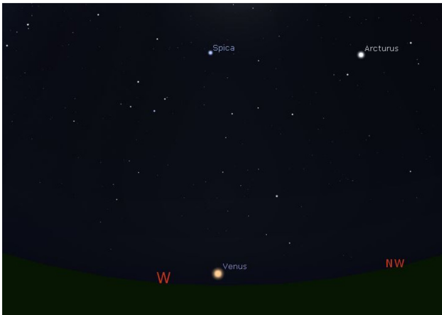
The sky looking west at 8:30 PM Brazilian time